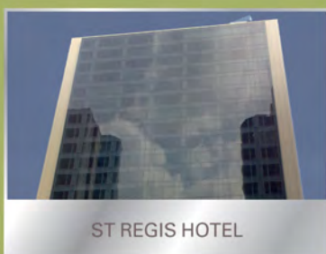
ST REGIS HOTEL