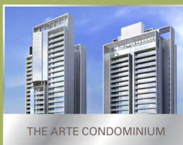
THE ARTE CONDOMINIUM